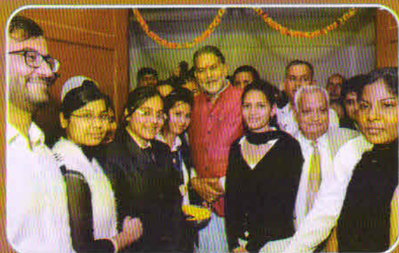
Education Minister, Harayna Along with Students at College Campus