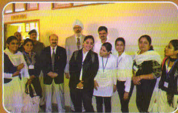
Legal Literacy Workshop at Fatehabad Judicial Complex